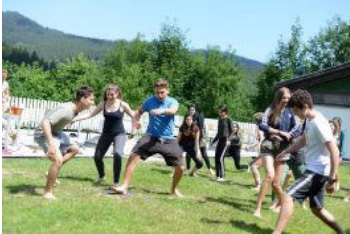
Students taking part in an art-workshop at PeaceCamp 2019

It sounds so worthwhile and interesting. What are your future plans related to PeaceCamp - or/and anything else connected with GISIG?